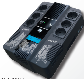
Zen-X 600 / 800 VA