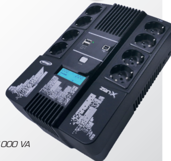
Zen-X 1000 VA