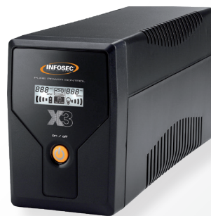
X3 500 / 650 / 800 / 1000 (EX models)