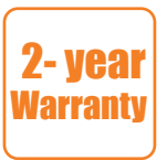
S6 Black Line II