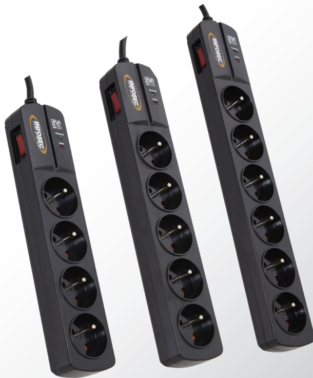
S4 Black Line II